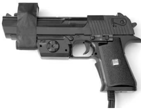
Figure 2. Gun Interface with d-Pad, Buttons, Trigger, and Orientation Tracker.

The ChairIO interface described above enables the user to navigate the game world. The remainder of the user's interactions have to be mapped onto another input device. For a FPS, the obvious choice for an interface is a gun. The device we have used is a light gun intended for use with a gaming console. Due to limitations of the light gun technology and the time needed to implement this into the game, we have chosen not to pursue that aspect of the gun. Instead, we make use of the gamepad components built into the gun, namely the trigger, the grip button, the "B" button (roughly where a typical trigger lock is), and the d-pad (see Figure 2). In addition, for two of our test setups, we required knowing the orientation of the gun in three degrees of freedom. For our testing we have used an Inertia Cube 2 from InterSense. This tracking device provides an absolute rotation in three axes with real-time update frequency and minimal drift.