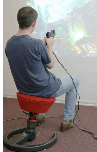
Figure 1. The ChairIO and a Game Gun Used as a First-Person-Shooter Interface.

In this paper, we present and evaluate a gaming interface based on a novel chair-based interface, the ChairIO, and an additional prop, a game console gun with additional gamepad functionality (see Figure 1 and 2). The ChairIO is based on an ergonomic stool with several unique properties that afford its usage as a gaming device. A user study already showed its potential as a highly intuitive and fun to use navigation device in a Virtual Reality (VR) application [3]. We believe that the stool device is not only successful for navigation, but that it also has a large realm of possibilities in gaming. As the stool device is mapped to a joystick input, it is usable in a variety of gaming applications with minimal effort. Here, we explore part of its