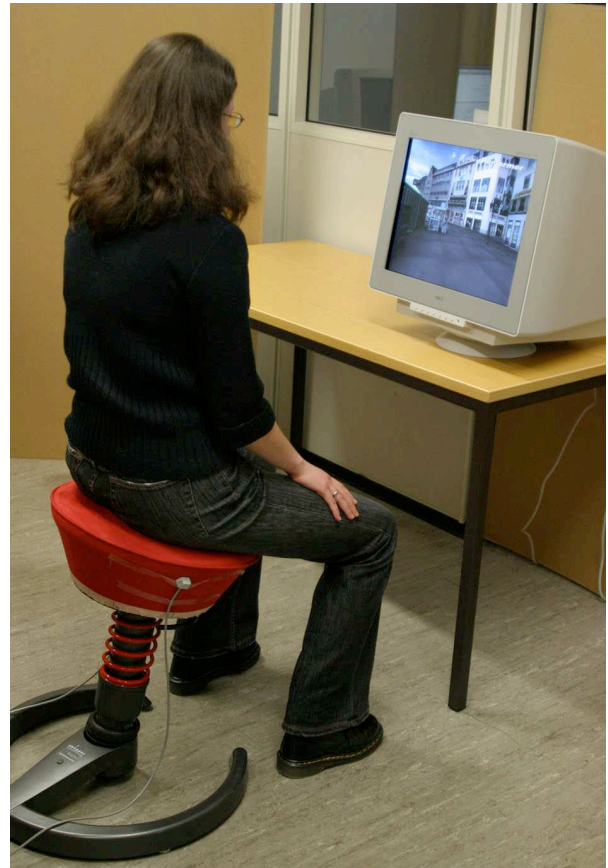
Figure 3. Chair Interface Used for Travel in VE.

Questions were asked of the users both before and after the user experience. The questions asked before pertained to the users previous experience with: gaming, devices such as joysticks and 3D mice, and VE's and other 3D navigation. The users were given four navigational tasks, once for each device. There was no training phase. Users were